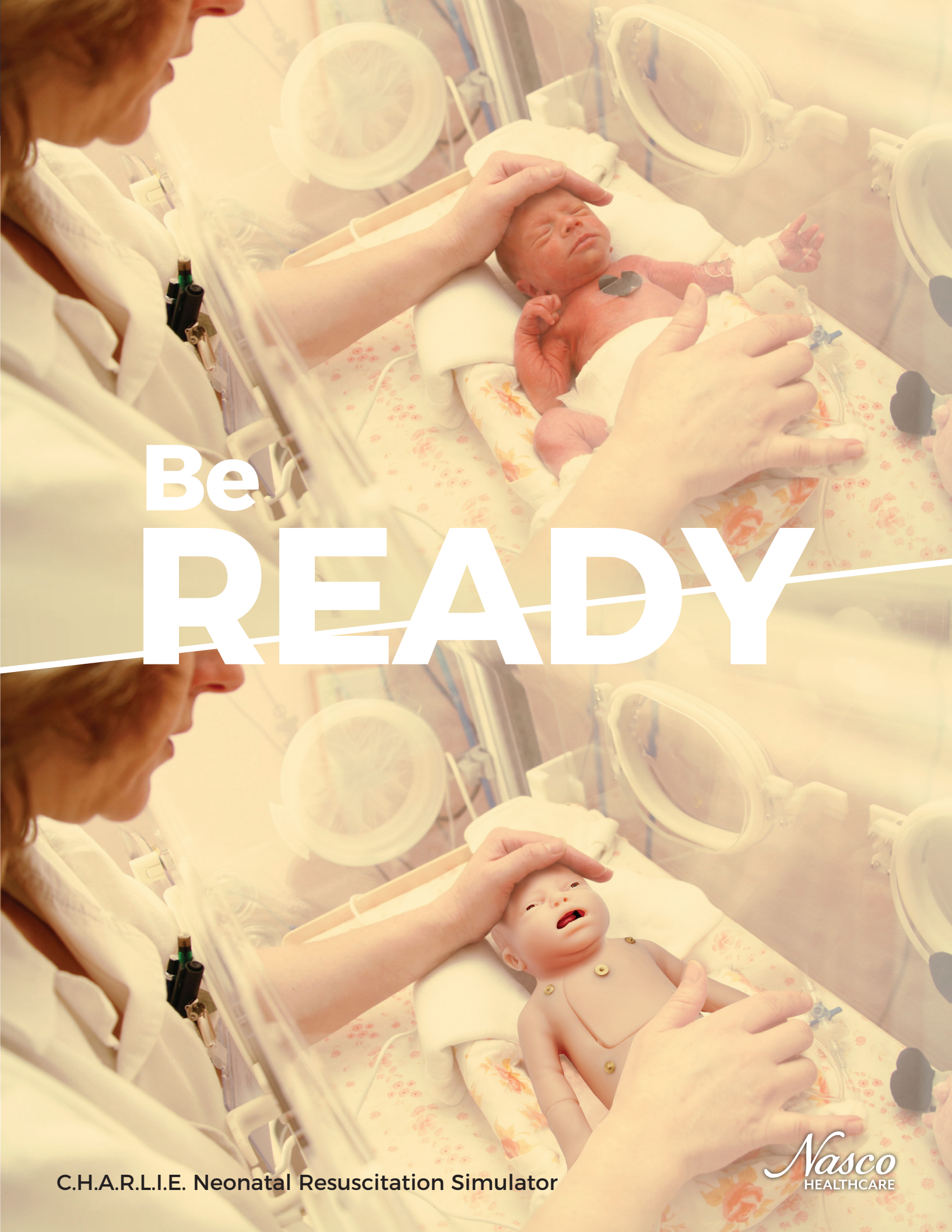
C.H.A.R.L.I.E. Neonatal Resuscitation Simulator

Nasco Healthcare 16 Simulaids Drive Saugerties, NY 12477 Phone: 1.833.NASCOHC (627-2642) Email: info@nascohealthcare.com www.nascohealthcare.com