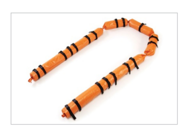
5-Section Flotation Collar attaches to the Model 71 to provide flotation assistance for water rescue

The Model 71 provides full-body protection to patients, even when they need to be transported across uneven, hazardous ground. The spacious basket stretcher offers room to accommodate blankets and life support equipment. It is available in several versions to accommodate your specific needs.