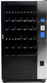
IIC Sightguard SEAVM

Vending machine for industrial and EMS applications; stainless steel front panel