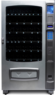
Envision Refrigerated ENV5C

Vending machine for industrial, EMS, and other ambient temperature applications