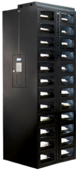
Versa SmartLocker 48