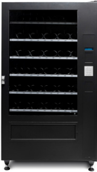
Optima Helix VN-HELIX.BK.001

Vending machine for industrial and EMS applications; stainless steel front panel