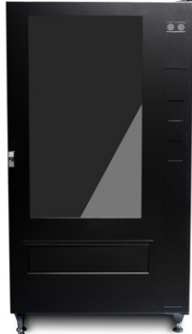
Optima Helix Touch VN-HELIX.BK.TS

Refrigerated vending machine for perishable items