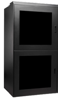
Versa SmartLocker 2

48-door two-sided locker with small bays