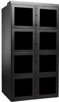
Versa SmartLocker 8