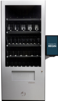
Vision ES Plus VISIONES-15

Vending machine for IT / Tech, retail, and other installations requiring branding or rich product information