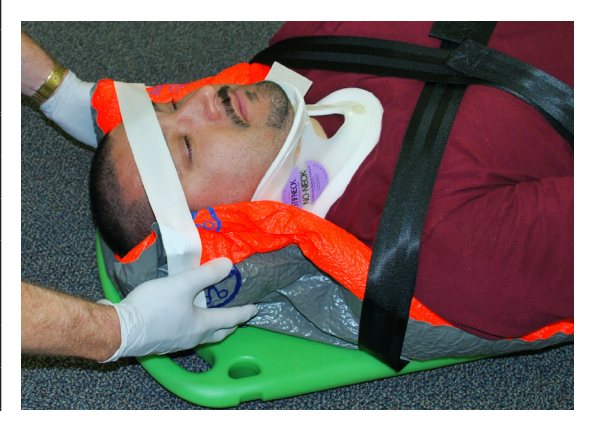
May be used with or without a C-collar as dictated by your local medical protocols.