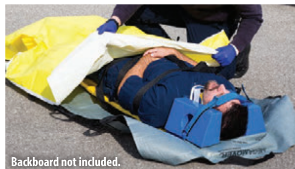
Backboard not included.

The MegaMover® Transport Chair is ideal for carrying patients in areas of limited space.