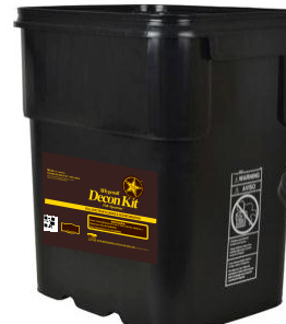
P/N: DKS008 On-Scene Decon Kit, REFILLABLE - REUSABLE

Expanded Hygenall OnScene Decon Kit.....DKS008E Contents includes the same as above DKS008, with the addition of Hygenall HandScrub for heavy grease and HAZMAT cleaning, and Pocket Size Hygenall FieldWash, Non-Rinse version for chemical and drug residue decontamination.