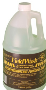
FSFHW8001G Hand, Hair and Body Wash