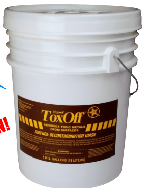
HT9005G PPE Cleaning, Extractor or Washing Machine. Also for Cleaning Floors and Vehicles.