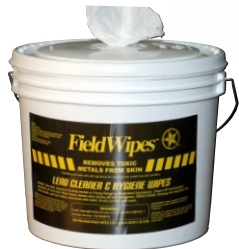
FW501NRTB 500 Wipe Bucket REFILLABLE

4 x 15 Packs for Whole Body Decon.....P/N: FW915AFF (Alcohol Free) 3 x 100 Packs for Hands, Face and Neck Decon.....P/N: FW903AFF (Alcohol Free)