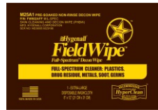
FW915AFF (case box P/N) Extra-Large 8"x12" Hand and Body Wipe Individually Wrapped Alcohol and Fragrance Free