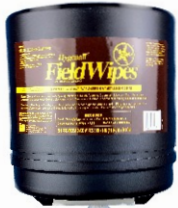
FWWM501 500 Wipe Wall Mounted Dispenser REFILLABLE