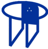
GR01 Gallon Bottle Wall Bracket