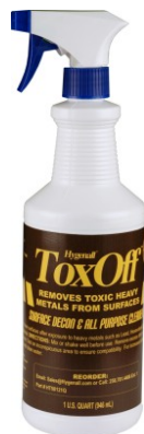
HT50121Q Spray-on/Wipe-off Surface Cleaner and Turn-out Gear Cleaner