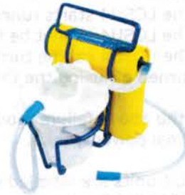
LCSU4 800 ml (4.3 lbs.) canister version