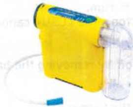
LCSU4 300 ml (3.3 lbs.) canister version

manufactured between May 1, 2015 until October 28 th , 2016