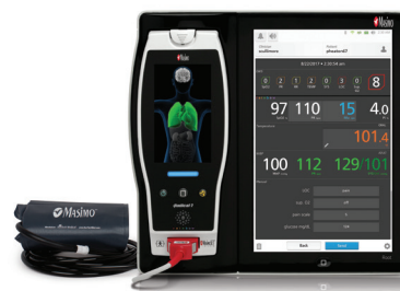
Root with Noninvasive Blood Pressure and Temperature