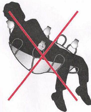
Improper Grasping (Cross-Handle)

The MegaMover ® Transport Chair is intended for limited use . If the unit is damaged, frayed, cut or soiled replace with new unit.