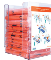
2101-H Z-Slider™ Single Pack Point-of-Care Clear Wall Mounting Holder