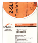
2103-H Z-Slider™ Large Point-of-Care Clear Wall Mounting Holder