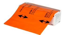
2102 Z-Slider™ Roll