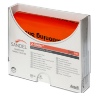
2104-H Z-Slider™ Small Point-of-Care Clear Wall Mounting Holder

➤ Contact your Ansell representative for ordering or more information.