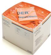
2101 Z-Slider™ Single Pack Individually Wrapped