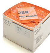
2151 Z-Slider™ XL Single Pack Individually Wrapped