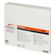
2104 Z-Slider™ Refill for Small Point-of-Care Clear Wall Holder