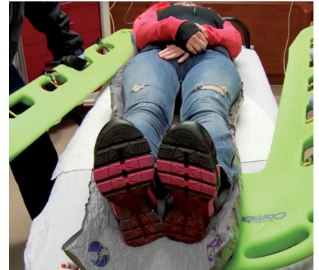
Safely extricate and transfer a patient to the cot. The CombiCarrierII is easily removed eliminating the loss of your valuable equipment.

The innovative design of the CombiCarrierII provides emergency medical and rescue personnel with two products in one, saving valuable storage space, weight and critical budget dollars. Comes with an industry leading 5-year warranty.