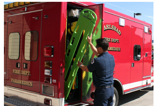
Fits In A Standard Backboard Compartment