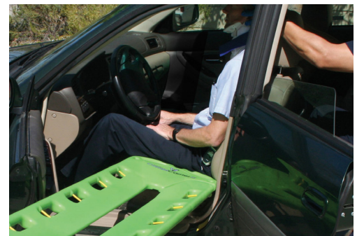
Tapered Ends To Simplify Extrication