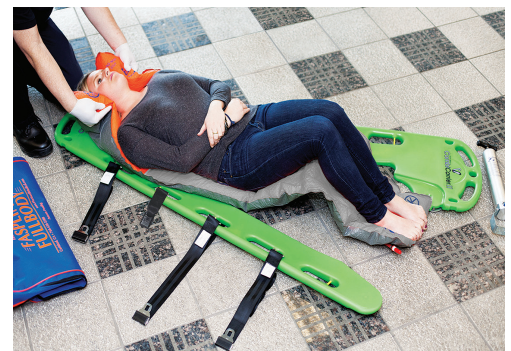
Can Be Easily Separated At Either End