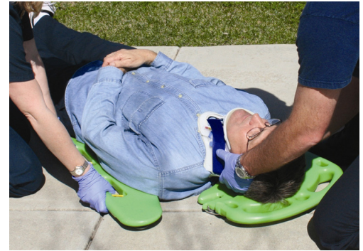
Functions Like A Scoop Stretcher