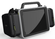
Monitor housing with an iPad Pro

Monitor has everything you need to start training and includes: