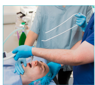
Airway Management • Airway Accessories