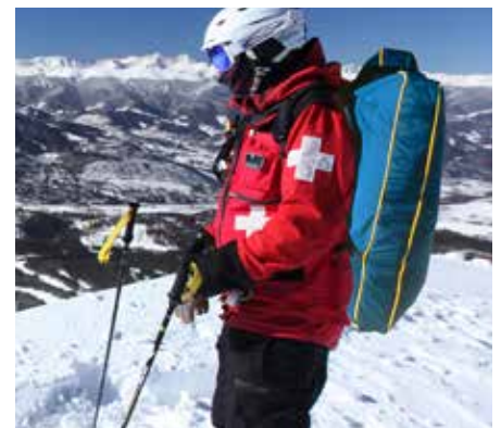
Optional backpack carry case available

The EVAC-U-SPLINT mattresses has six large padded handles secured to the perimeter of the mattress which provide improved security when moving and transferring a patient and also allows for rescuers to share handles when handing off a patient in tight quarters. The EVAC-U-SPLINT is filled with thousands of polystyrene beads which act as a thermal insulator to help maintain the patient's core body temperature decreasing the potential for hypothermia.