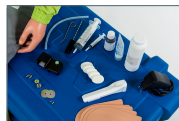
Accessories included in packaging