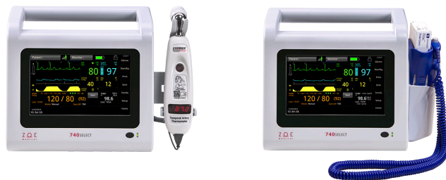
Exergen Temporal Artery Scanner

FILAC™ 3000 Predictive or Exergen TemporalScanner™