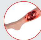
Full Leg Trauma Trainer