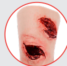
Leg Wound Task Trainer