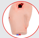
Shoulder Task Trainer