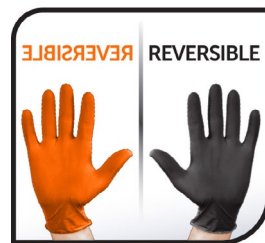
Two Gloves In One