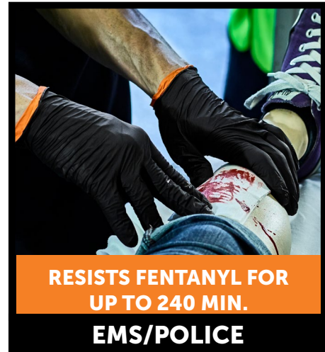
RESISTS FENTANYL FOR UP TO 240 MIN. EMS/POLICE